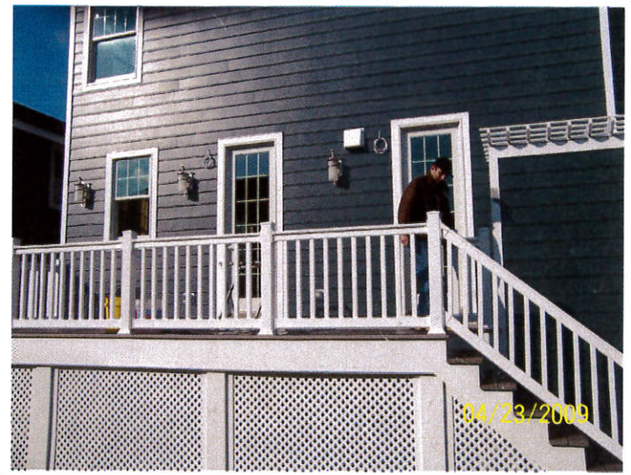
Rear View – Date of Photograph: (See Photo Stamp)