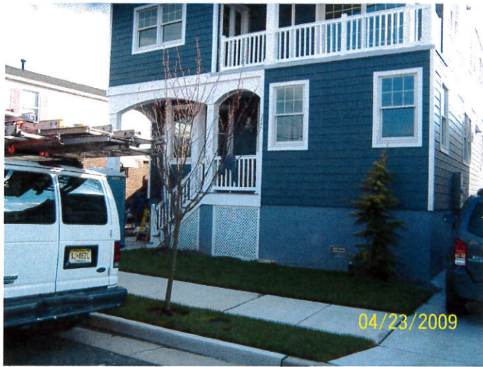
Front View – Date of Photograph: (See Photo Stamp)

If using the Elevation Certificate to obtain NFIP flood insurance, affix at least two building photographs below according to the instructions for Item A6. Identify all photographs with: date taken; "Front View" and "Rear View"; and, if required, "Right Side View" and "Left Side View." If submitting more photographs than will fit on this page, use the Continuation Page, following.