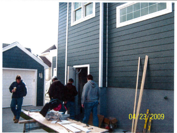
Left Side View – Date of Photograph: (See Photo Stamp)