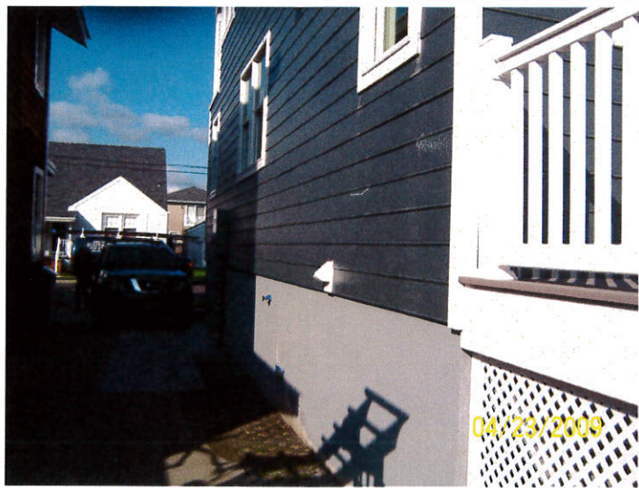
Right Side View – Date of Photograph: (See Photo Stamp)